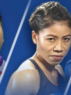
Padma Vibhushan M.C. Mary Kom Ph.D (HC) Chef-de-Mission London Olympics 2012