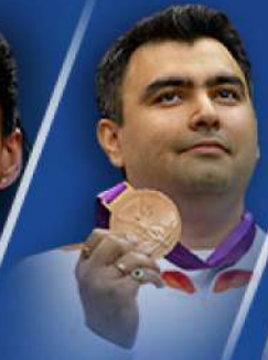
Gagan Narang Class of 2012, MBA Chef-de-Mission Summer Olympics 2024