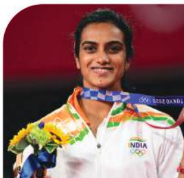
PV Sindhu International Badminton Player, Manav Rachna Excellence Awardee Flagbearer, Paris Olympics 2024