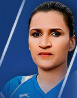
Padma Shri Rani Rampal Ph.D (HC) Bronze Medalist, Tokyo Olympics 2020